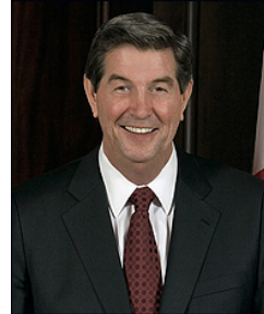
GOVERNOR BOB RILEY

Governor Bob Riley was sworn into office for a second term as Alabama's chief executive in January 2007, following a successful first term marked by great progress for the state. During those first four years, Governor Riley made good on promises to improve education, put Alabama's economy on the right track and restore honesty to the Governor's Office. The people overwhelmingly endorsed the Governor's actions and his vision for a second term. They re-elected him with 58% of the vote, making him only the third sitting Alabama governor to win re-election in modern times.